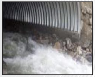
OPEN BOTTOM ARCH ON WATERCOURS