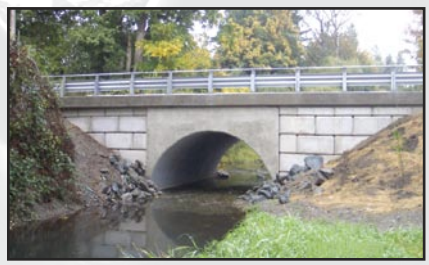
PIPE-ARCH CULVERT WITH BURIED INVERT ON WATERCOURSE