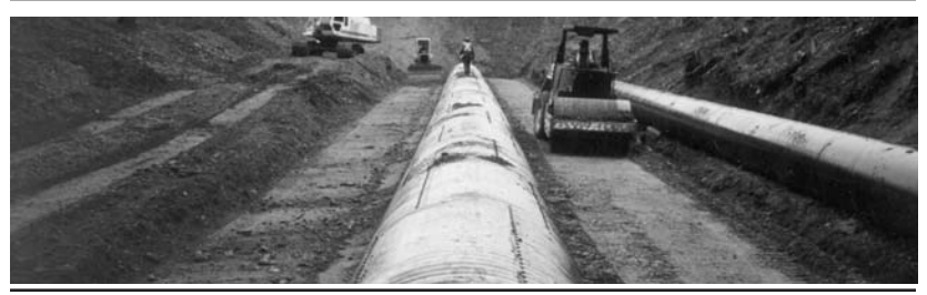
Compaction parallel to pipe.