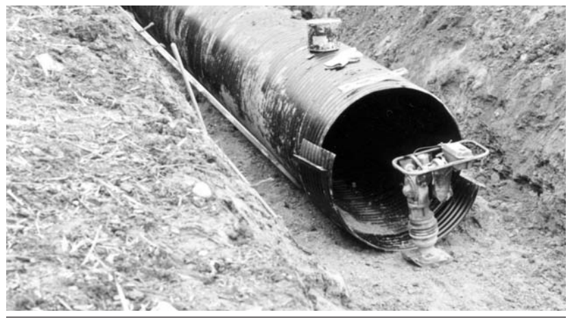
Polymer Laminated CSP.

1. The polymer coating used for CSP is applied as a film or laminate (polyethylene acrylic acid copolymer). This system is applied over the galvanized sheet described above. The polymeric coating is furnished in one grade: 10/10 [250/250]. The numbers designate the minimum coating thickness in mils (thousandths of an inch) and in \mu m (thousandths of a meter). This product is furnished to the requirements of CSA G401, ASTM A742 / A742M or AASHTO M-245.