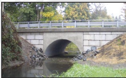
PIPE-ARCH CULVERT WITH BURIED INVERT ON WATERCOURSE