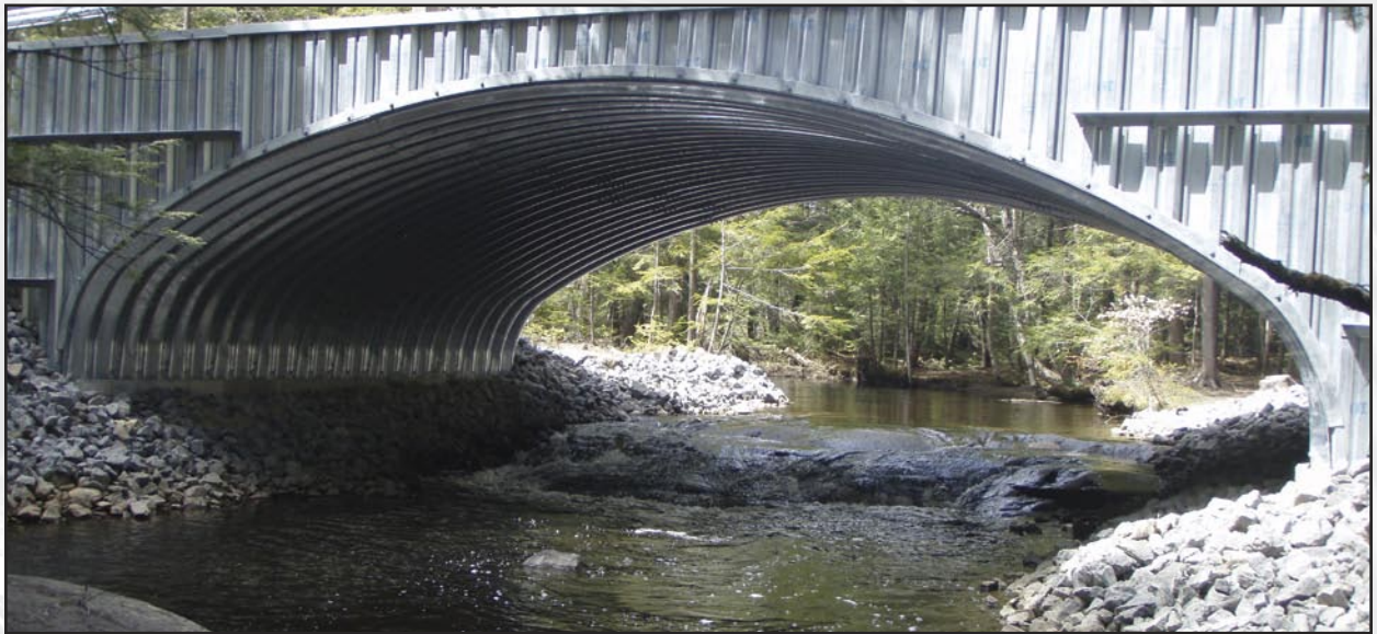
Figure 3 – BSS Box Culvert Bridge on Footings (Includes Steel Sheet Pile Headwall)

Options for the protection of plate structures with shallow cover from roadway contaminants infiltrating the overburden and coming into contact with the shell include: