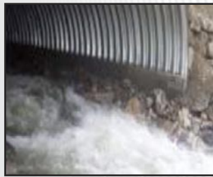
OPEN BOTTOM ARCH ON WATERCOURSE